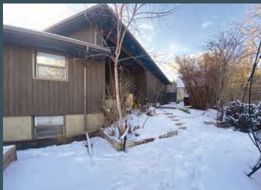
Left: This before shot shows the house in Calgary before Morgan K Landscapes got to work.

Staying within a feasible budget was also a factor in making this project possible. The company tried to match the conceptual design as close as possible while keeping install very efficient. The team tried not to have any additional overages above and beyond the initial budget projection.