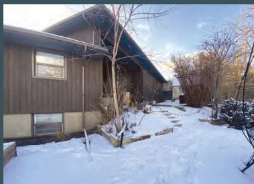
Left: This before shot shows the house in Calgary before Morgan K Landscapes got to work.

Staying within a feasible budget was also a factor in making this project possible. The company tried to match the conceptual design as close as possible while keeping install very efficient. The team tried not to have any additional overages above and beyond the initial budget projection.